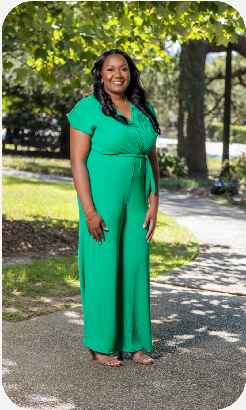
During a branding shoot, various aspects of the brand are highlighted, including products, services, and the overall lifestyle associated with the brand. These images can be used across multiple platforms, such as social media, websites, marketing materials, and advertisements, to create a consistent and appealing image that attracts and engages customers.